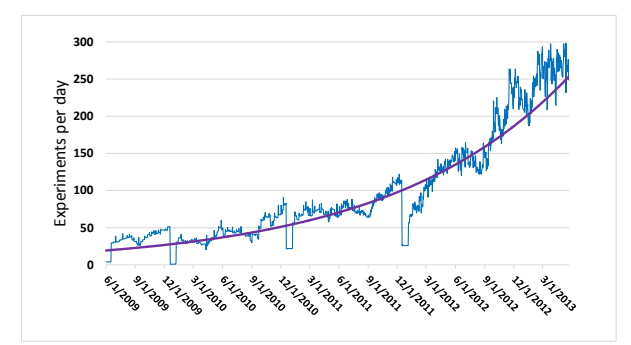
Figure 2: Exponential growth in experimentation over time. (Prior to 2012, Bing shut down most experiments the last two weeks of December.)

The problem that the Bing Experimentation System addresses is how to guide product development and allow the organization to assess the ROI of projects, leading to a healthy focus on key ideas that move metrics of interest. While there are many ways to design and evaluate products, our choice of controlled experiments for Knowledge Discovery derives from the desire to reliably identify causality with high precision (which features cause changes in customer behavior). In the hierarchy of possible designs, controlled experiments are the gold standard in science [17].